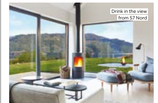
Drink in the view from 57 Nord

BOOK IT: From £1,050 for three nights, off-peak, self-catered. 57nord.co.uk