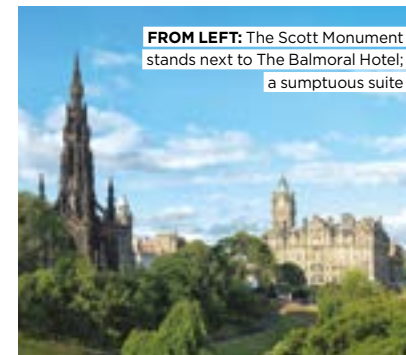
FROM LEFT: The Scott Monument stands next to The Balmoral Hotel; a sumptuous suite