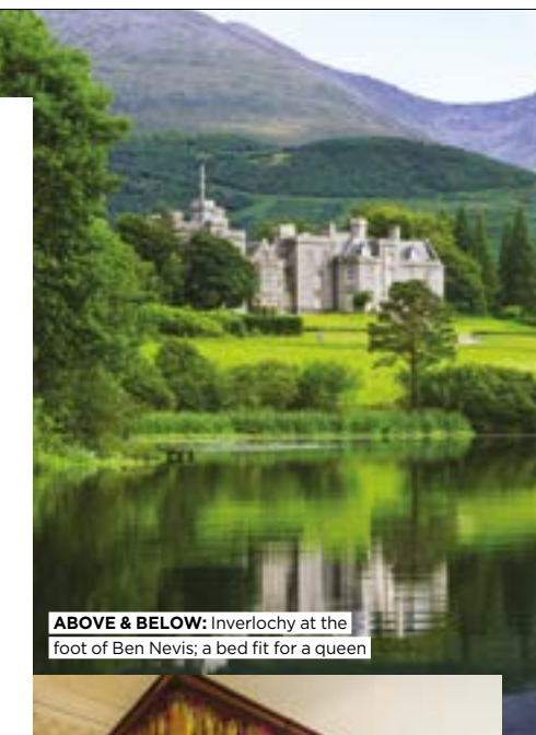
ABOVE & BELOW: Inverlochy at the foot of Ben Nevis; a bed fit for a queen

BOOK IT: Doubles from £375 B&B. inverlochycastlehotel.com