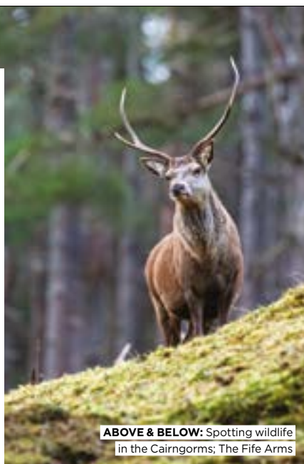
ABOVE & BELOW: Spotting wildlife in the Cairngorms; The Fife Arms

BOOK IT: Doubles from £435 B&B. thefifearms.com