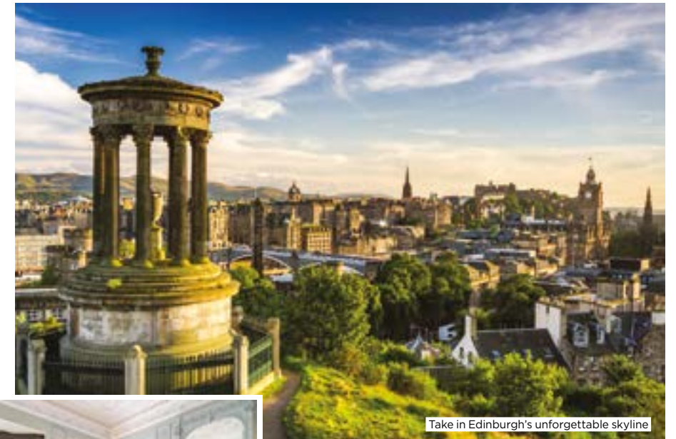
Take in Edinburgh's unforgettable skyline

In many respects, Scotland's compact capital ( right ) is the perfect precursor for what is to come: inventive food, diverse culture, endless hills, enormous bodies of water on all sides and some of the finest hotels in the world. Conveniently located on Princes Street above Edinburgh Waverley station, The Balmoral (p148) is one of the city's most beloved addresses, and a perfectly positioned launch pad to experience the city. Opt for a room with a view of Princes Street Gardens and Edinburgh Castle, the first of many castles on your route. So inspiring is its energy that author JK Rowling chose to finish writing the final book in the Harry Potter series, Harry Potter and the Deathly Hallows , in one of its luxurious suites. BOOK IT: From £180 B&B. roccofoorthotels.com