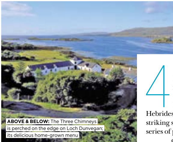
ABOVE & BELOW: The Three Chimneys is perched on the edge on Loch Dunvegan; its delicious home-grown menu