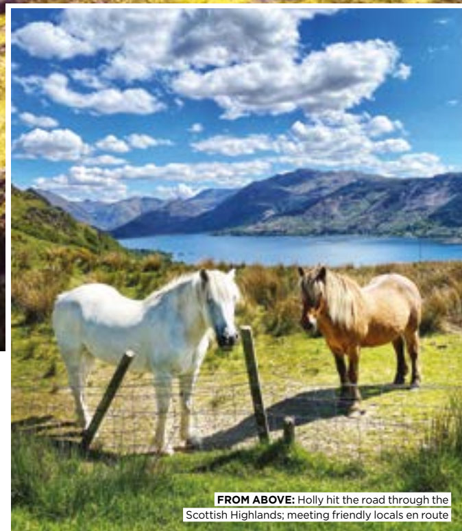
FROM ABOVE: Holly hit the road through the Scottish Highlands; meeting friendly locals en route

Five hundred miles is a distance synonymous with Scotland, whether it's walking 500 miles in the classic Proclaimers hit or driving the same distance on the North Coast 500 road, the popular coastal trip covering the northern half of Scotland. If you're keen to tick off this diverse country's most memorable stops and epic landscapes in one trip – and stay in some of the very best hotels along the way – we have a new route for you. A 500-mile loop from east to west coast and back again. We call it: the Highland Beginner's 500.