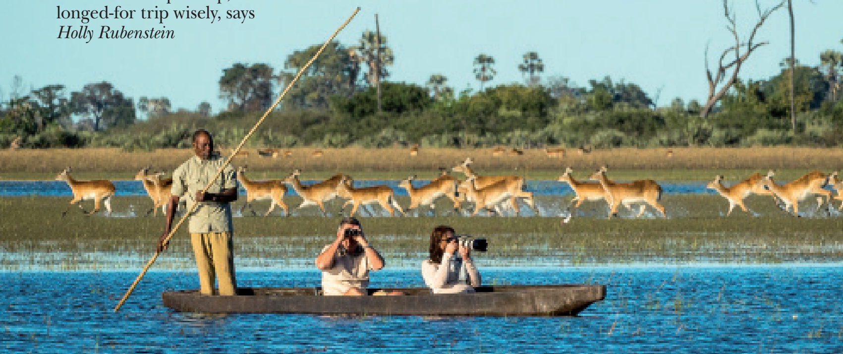
Take a mokoro canoe to explore the rich wildlife of the Okavango Delta at Jao camp (below)

As the world opens up, choose that longed-for trip wisely, says Holly Rubenstein