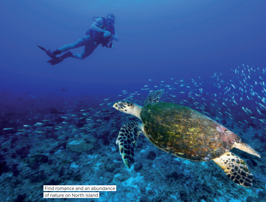
Find romance and an abundance of nature on North Island