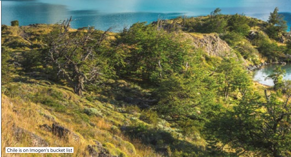
Chile is on Imogen's bucket list