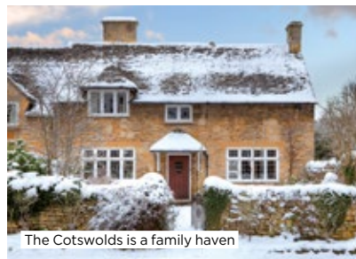
The Cotswolds is a family haven

⤴ Where do you keep going back to? We've recently found a perfect spot in the Cotswolds, which is close enough to London to be very reachable for a weekend. There are lakes and lots of fun activities for the daytime and cosy lodges for family evenings together.