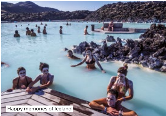
Happy memories of Iceland

⤴ Where was your happiest holiday? I spent a few days in Iceland back in 2014 with my new man at the time. It was a very happy holiday because I brought home the best souvenir – I'd fallen pregnant with our daughter. We went back there last year as part of my European tour and swam with her in the geothermal pools and watched the Northern Lights together. So many happy memories.