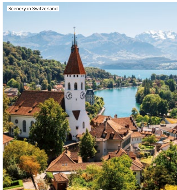
Scenery in Switzerland

⤴ Where have you learnt the most about yourself? Lake Natron in Tanzania, researching the sounds for a potential score. It made me realise that any sound can be musical. It sounds daft now, but before that trip I had never considered the sounds around me as a musical input. I had been limiting myself to traditional instruments.