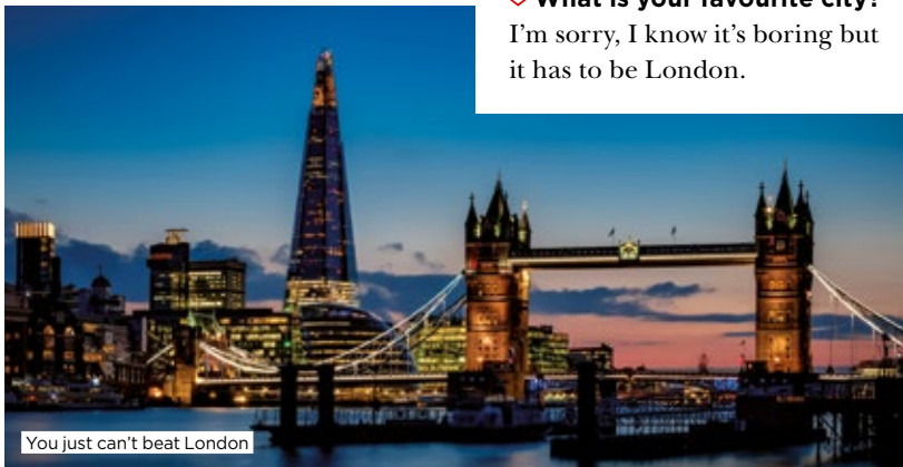
You just can't beat London

⤴ What is your favourite city? I'm sorry, I know it's boring but it has to be London.