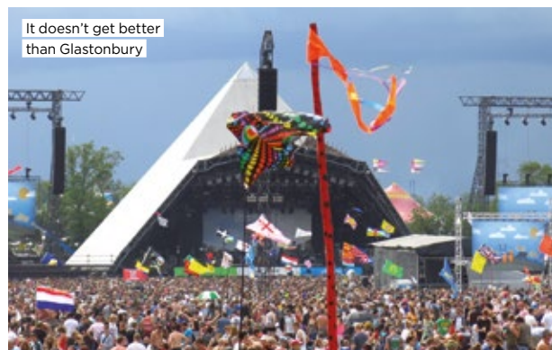
It doesn't get better than Glastonbury