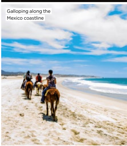
Galloping along the Mexico coastline

⤵ Where was your happiest holiday? My wife and I went to Mexico many years ago and it was the first time I'd ridden a horse. We rode on an incredible beach and at a particular moment it started to rain. It was a magical memory that now feels almost unreal.