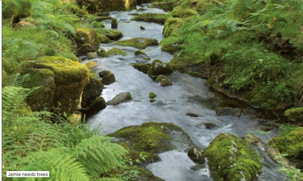
Jamie needs trees