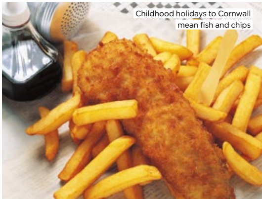
Childhood holidays to Cornwall mean fish and chips

⤴ What destination most reminds you of childhood holidays? Cornwall. We went to Looe practically every year of my childhood. Same house, same fish and chip shop, same beach and the same brilliantly changeable weather.