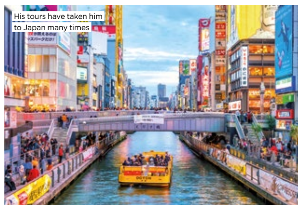
His tours have taken him to Japan many times

⤵ You've toured the world. Which performance location was the most memorable and why? It can surely only come back to the main stage at Glastonbury Festival. I have been a gleeful attendee of the festival for many years and to play on that stage to a big and boisterous audience was a real moment for me.