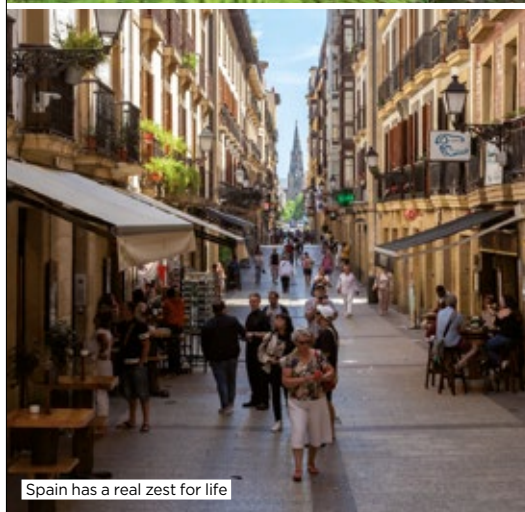
Spain has a real zest for life

⤴ What is your favourite city? I'm a country boy really but again, I'd have to take it to Spain – San Sebastián, Madrid or Barcelona. We all know how rich the culture is, how good the food is – but it is the people that make it. The Spanish have a twinkle in their eye and, when it really matters, they can step back and not take life too seriously. It bleeds a real enthusiasm for life.