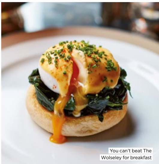
You can't beat The Wolseley for breakfast

⤴ Where do you always eat well? At my kitchen table! My wife is a fabulous cook. Failing that you can't go wrong at The Wolseley.