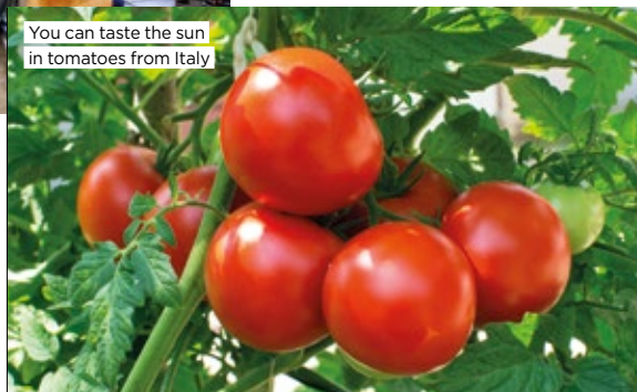
You can taste the sun in tomatoes from Italy

⤵ Tell us about your hidden gem? Madonna Inn in San Luis Obispo, California. It very much appeals