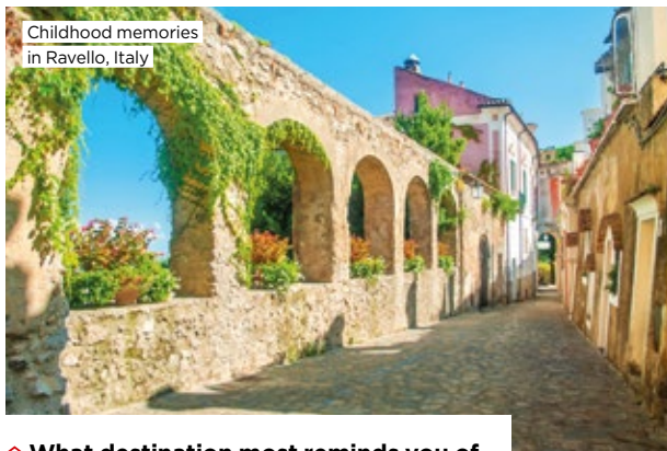
Childhood memories in Ravello, Italy