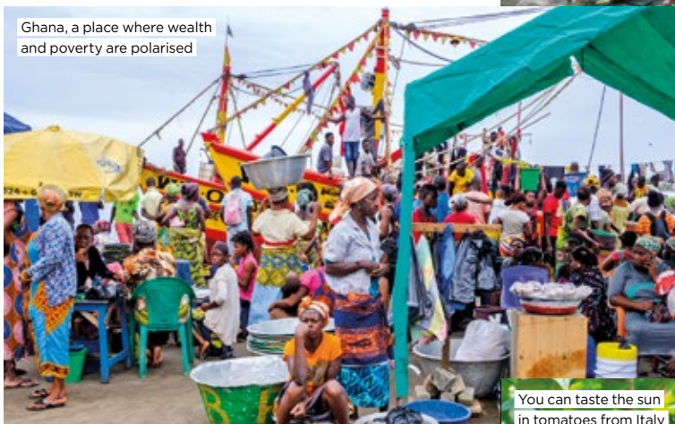
Ghana, a place where wealth and poverty are polarised

⤴ Where did you learn something new about yourself? The destination that was most life-changing was when I spent three weeks travelling in Ghana. It's a place where poverty and wealth are polarised. I found it both harrowing and optimistic.