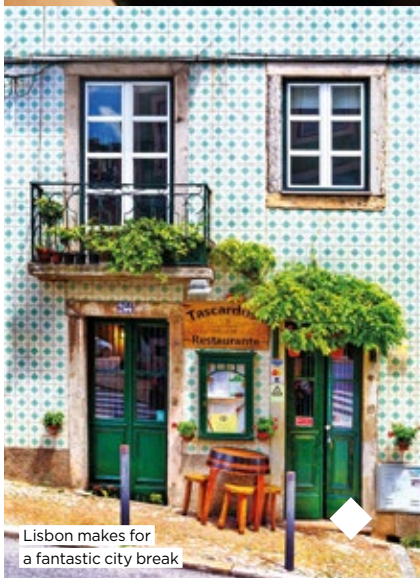
Lisbon makes for a fantastic city break