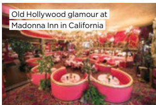
Old Hollywood glamour at Madonna Inn in California

⤴ Where did you learn something new about yourself? The destination that was most life-changing was when I spent three weeks travelling in Ghana. It's a place where poverty and wealth are polarised. I found it both harrowing and optimistic.