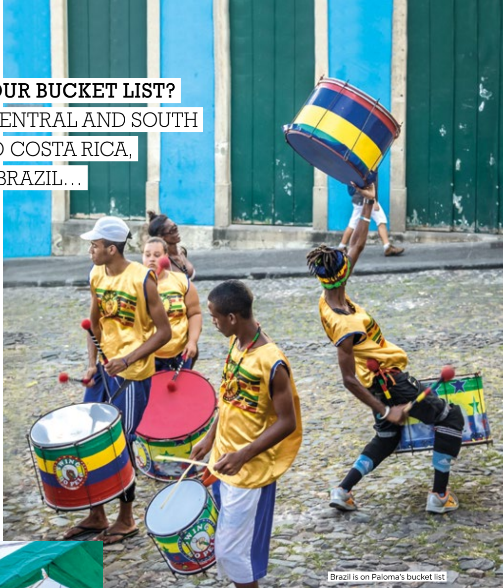
Brazil is on Paloma's bucket list

⤴ How about the best hotel you've stayed in? The Bowery in New York embodies the spirit of the city. I always meet people in the bar downstairs and have interesting conversations. Plus, it has nice beds and nice sheets, which are the key to everything. The other one is a really cute little hotel called Bourg Tibourg in Paris. There's no room to swing a cat in the rooms, but I find it evocative and it makes me feel creative. It's a good writers' hotel.