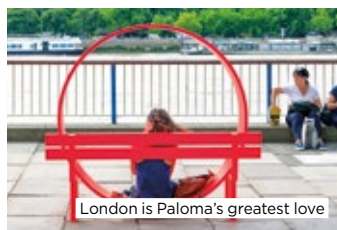
London is Paloma's greatest love

⤵ Where do you always eat well? If you haven't eaten a tomato fresh off the plant from Italy then you haven't lived. You can taste the sun and their soil in everything, and that's why they have the luxury of not having to overcomplicate their cooking.