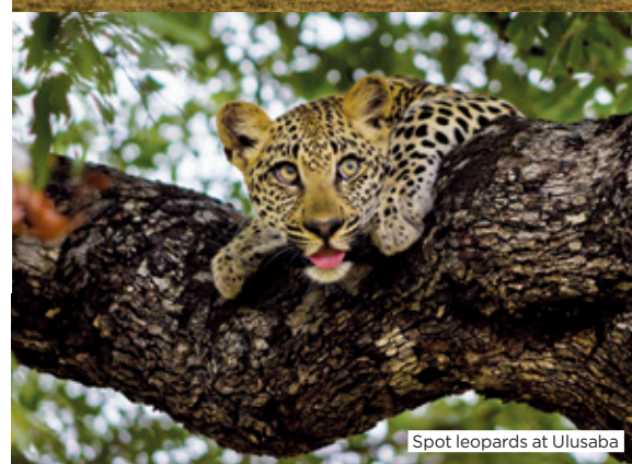
Spot leopards at Ulusaba