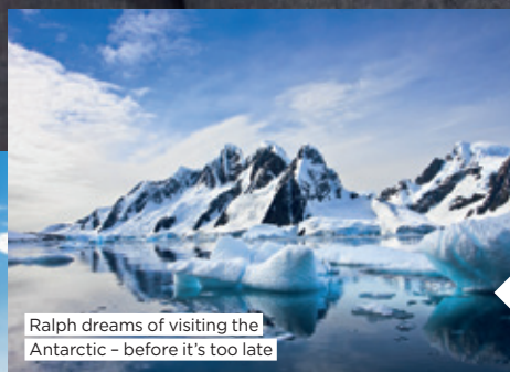
Ralph dreams of visiting the Antarctic – before it's too late