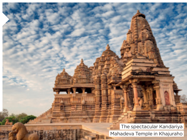
The spectacular Kandariya Mahadeva Temple in Khajuraho

What is your happiest holiday memory? I had a very happy time in Madhya Pradesh, India. I wanted to get a taste of ordinary travel, so I travelled by train, avoiding first class. There are amazing old fortresses and temples in the region, in particular, the Khajuraho temple in Chhatarpur, known for its erotic carvings.