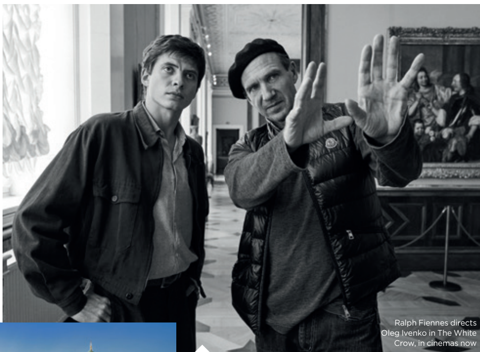
Ralph Fiennes directs Oleg Ivenko in The White Crow , in cinemas now