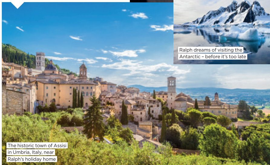
The historic town of Assisi in Umbria, Italy, near Ralph's holiday home

When you need to unwind, where do you escape to? For years I have returned back to my holiday home in Umbria. It's nothing grand, but it's a peaceful, rural setting where all I do is read, eat, walk and sleep.