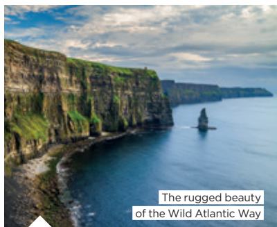
The rugged beauty of the Wild Atlantic Way

Russia holds a deep fascination for Ralph Fiennes, says Holly Rubenstein