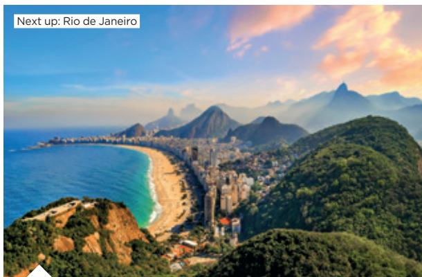
Next up: Rio de Janeiro

What's at the top of your bucket list? I've never been to South America. I want to go to Rio and Macchu Picchu, and I would love to then go right down south on a trip to Antarctica before it completely disappears (partly caused by the engine fuels from the boat I'm on). Maybe I'll get to visit Peru if we film Paddington 3 !