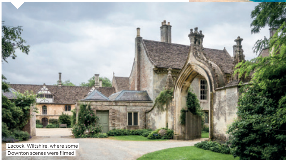
Lacock, Wiltshire, where some Downton scenes were filmed