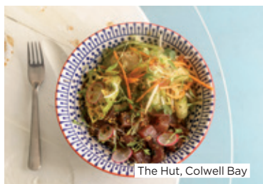
The Hut, Colwell Bay

J Sheekey in London, and The Hut in Colwell Bay on the Isle of Wight. The most extraordinary piece of food theatre I've experienced was at Noor in Cordoba, Spain. A pageant of food appears bit by bit, with grace and elegance.