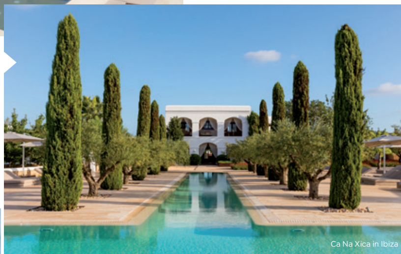
Ca Na Xica in Ibiza

Where do you keep going back to? We keep going back to Ibiza, but my days of foam and whistles are long gone. We go because my wife works on photo shoots for her shirt brand Indigo Island there. We've recently discovered Ca Na Xica which is a tranquil, modern boutique hotel - perfect for couples who want to unwind. My wife works and I lie by the pool feeling really helpful.