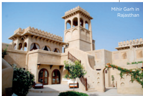
Mihir Garh in Rajasthan