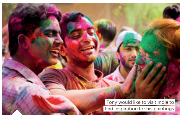
Tony would like to visit India to find inspiration for his paintings