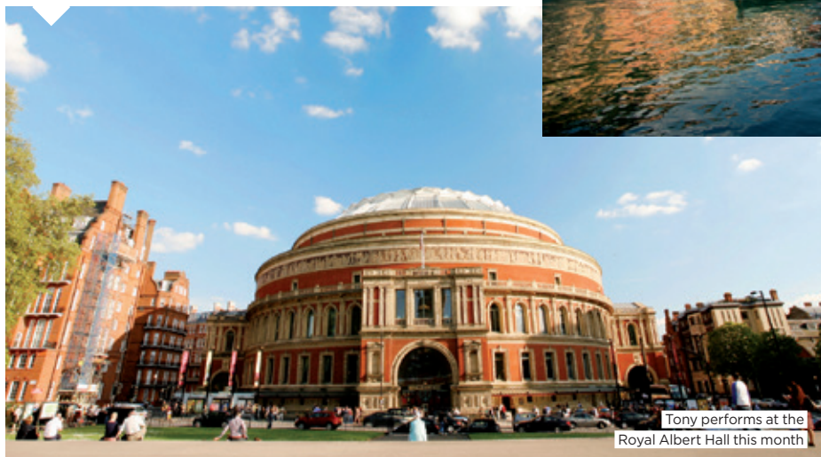
Tony performs at the Royal Albert Hall this month

You've toured the world many times over. Where was most memorable? London – and I say this not because I am going to be performing at the Royal Albert Hall this month (June), but because the British public have been so good to me ever since I first came to England in the 1950s. It's a second home to me when I perform there and I am thrilled at the age of 92 still to be able to travel and sing for my fans in England.