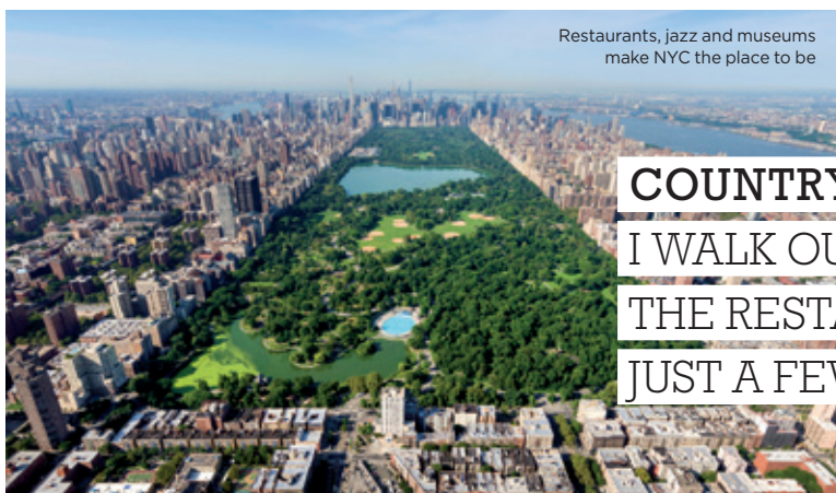
Restaurants, jazz and museums make NYC the place to be

COUNTRY OR TOWN HOUSE? TOWN HOUSE. I WALK OUT OF MY APARTMENT AND HAVE ALL THE RESTAURANTS, JAZZ CLUBS AND MUSEUMS JUST A FEW BLOCKS AWAY IN ANY DIRECTION.