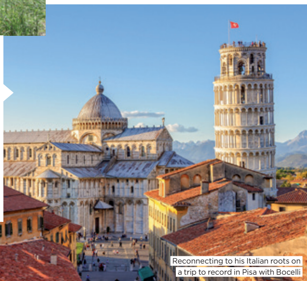
Reconnecting to his Italian roots on a trip to record in Pisa with Bocelli

During the making of Duets II album, I was in Pisa to record with Andrea Bocelli and took a side trip to Podargoni, where my family is from. I sang O Sole Mio on the same hill that my father did, overlooking the town. It was a very powerful experience.