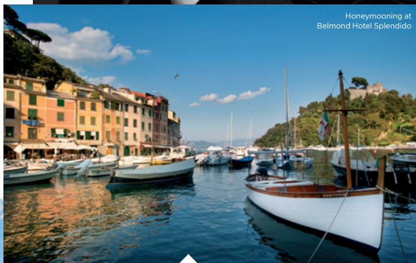
Honeymooning at Belmond Hotel Splendido