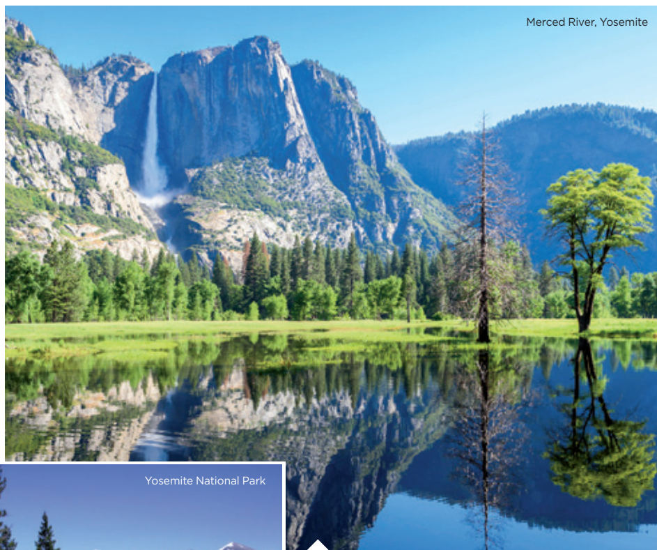
Merced River, Yosemite

When you need to unwind, where do you escape to? I don't have to go far as I have an art studio in my NYC apartment. Being both a performer and a painter has been a beautiful yin-yang relationship that has enabled me to never get burned out. As a singer, being on stage is a very gregarious endeavour. Painting is the exact opposite as it's just myself and a blank canvas.