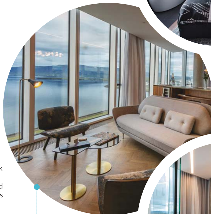
Esja Corner Suite, Tower Suites