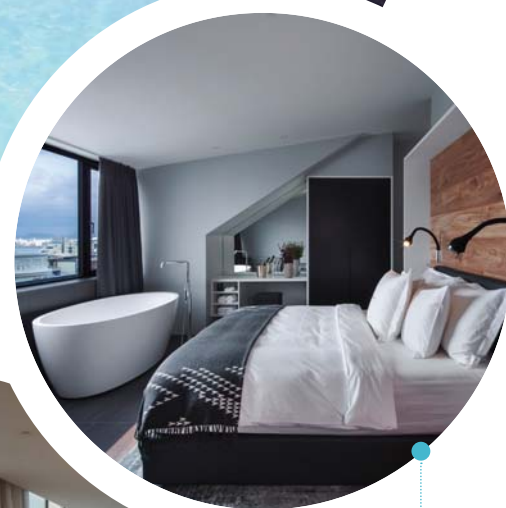
Panorama Suite, Ion City Hotel